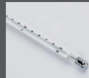
Glass Thermometer detail included in the standard delivery.