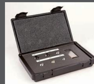
Kit of 6 balls supplied in the case.