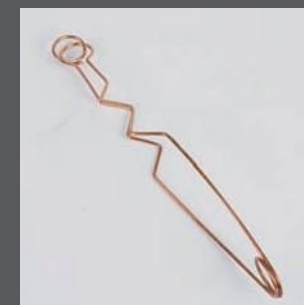
Pincers to grab up the balls after the set is used.